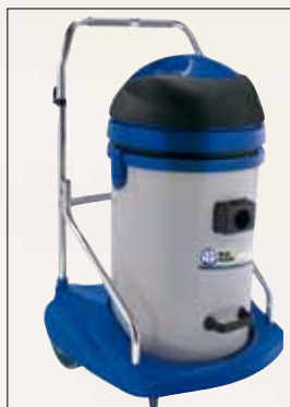
Mod.4300P · 4400P